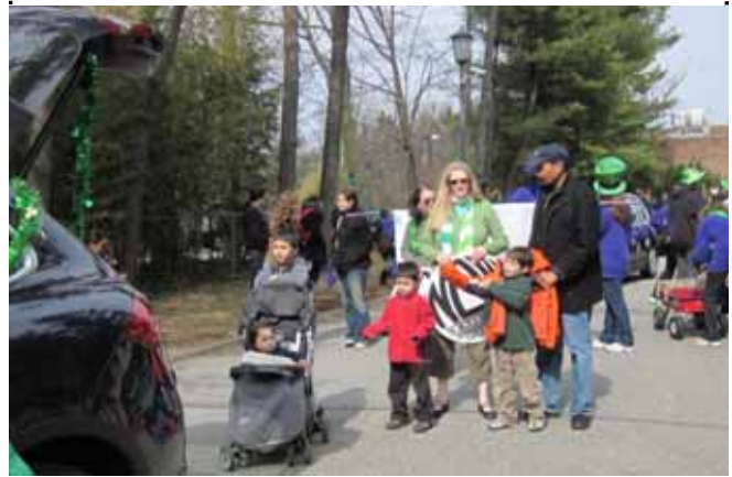
The Tivade family (minus 1) marching on St. Patrick's Day.